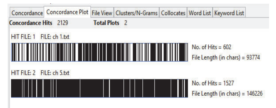
Figure 1. Concordance Plot showing the number of words used in and the length of Chapter 1 and Chapter 5 of A Portrait

An initial comparative glance at the first and the last chapter of A Por trait finds noticeable style shifts. In Chapter I, for instance, a simpler style is used in order to recreate the less refined, more naïve point of view of the young protagonist, opposed to the more complex style of the fifth chapter. This translates into longer sentences, a much higher quantity of commas per number of words and the richer lexical variety of Chapter V, which has twice the number of word types compared to Chapter I: 4592 vs 2345.